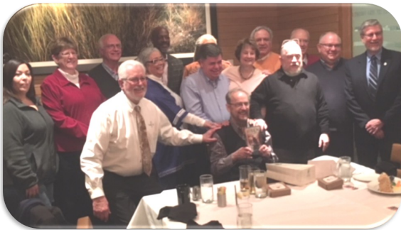
IL Conference Staff gathered for Farewell Luncheon

Throughout my ministry in the Illinois Conference, I have been blessed by working with many gifted, talented and generous persons. I am deeply grateful for the love and support I have received from so many servants of Christ and the Church while with you in Conference Ministry.