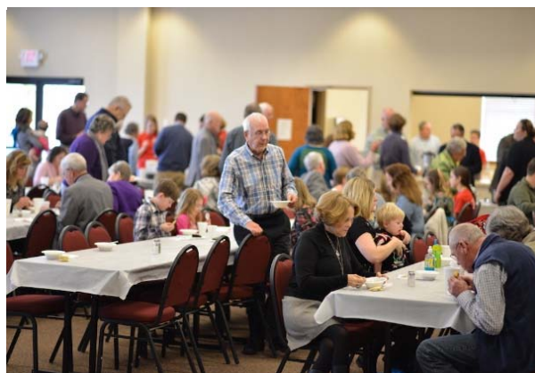
Community members come together for dinner and conversation at Grace Cafe.

On Sept. 11, Grace Cafe returns to the Elmhurst community for its 11th year. Grace Cafe was started in 2007, as an ecumenical mission project to provide a free hot meal to anyone in the community and is currently supported by thirteen Elmhurst churches whose members provide two dinner gatherings per month for their guests. This year offers 18 opportunities for fellowship and sharing a meal, from September through May 2018. Community members who are hungry, lonely, facing a tight budget or are eager