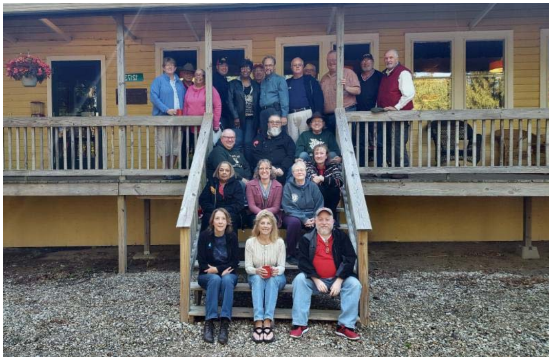
Illinois Conference members meet at Tower Hill during a two-day meeting.