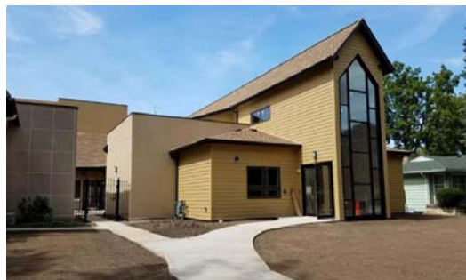
St. John UCC, Kankakee new church building.

St. John UCC in Kankakee is planning a dedication service for their new church building addition which is scheduled for Sunday, Oct. 29. Building upon a vision the congregation has had to expand their facilities and to make those facilities totally accessible, the congregation undertook a campaign to raise funds. These funds will be used to add a new fellowship hall and kitchen, new office space, new meeting space, an elevator that reaches all levels of the building and accessible bathrooms. We look forward to the opportunities that this new addition brings for the congregation.