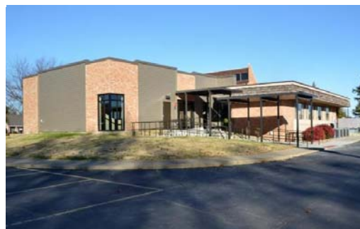
St. Luke Union Church, Bloomington completed building project making the building more accessible.

St. Luke Union Church in Bloomington, a union church of the Presbyterian and United Church of Christ, recently completed a building project which increased their ability to extend their ministry into the future. They now are an accessible facility to all levels of their campus, provide generous new fellowship and classroom space as well as a fully functioning kitchen facility to provide opportunities for outreach and congregational fellowship. The Eastern and Western Associations will soon enjoy this new space when they gather for the joint Fall Association meeting in October.