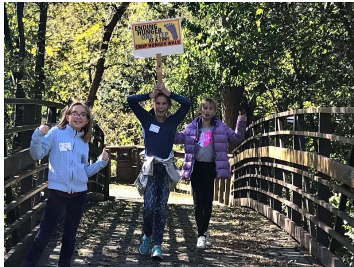
Youth from Northfield Community Church participate to raise hunger awareness during Church World Service Crop Hunger Walk.

More than 100 children, youth and adults from seven area congregations showed up to volunteer, raise hunger awareness and to raise funds for various missions and programs supported by CWS; 25% of all the monies donated are used locally. In 2017, NCC ranked sixth among all congregations nation-wide, raising nearly $20,000. This year, the congregation has received more than $26,000 in donations.