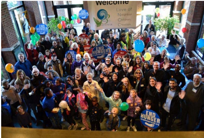
Northfield Community Church Crop Hunger Walk volunteers.