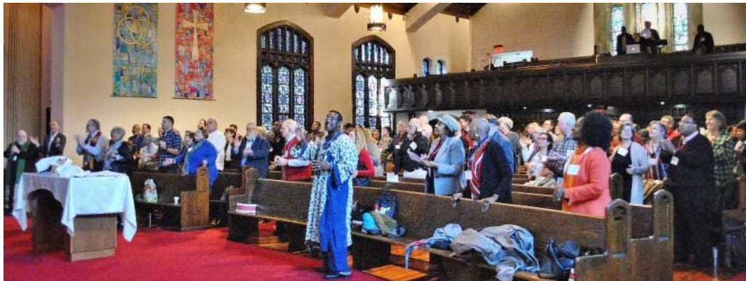
Fox Valley Association and Chicago Metropolitan Association worship led by the Lighthouse Church.