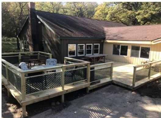
View of the new deck at Pilgrim Park.