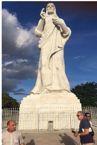
The Christ of Havana is the fourth largest sculpture representing Jesus of Nazareth in Havana, Cuba.

"Now he who supplies seed to the sower and bread for food will also supply and increase your store of seed and will enlarge the harvest of your righteousness. You will be enriched in every way so that you can be generous on every occasion, and through us your generosity will result in thanksgiving to God." 2 Cor. 9:10-11