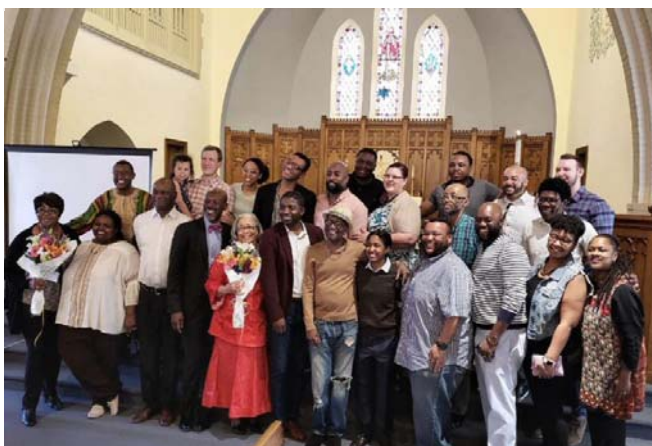
Lighthouse Church members who gathered when their congregation joined the CMA.