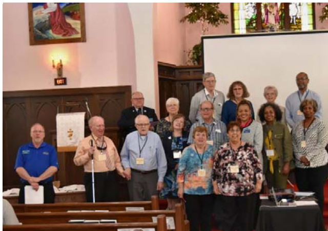
Elected and installed as officers and committee members for the Eastern Association and Conference.