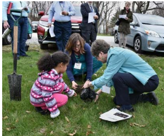
Planting a redbud seedling at Bethlehem UCC in Sutter.