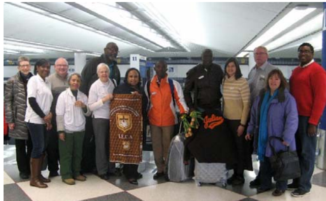
The Angola Partnership Team welcoming our visitors from Angola arriving in Illinois.