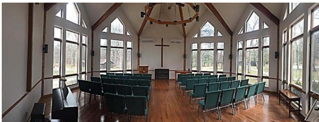
Renovated Cleveland Chapel at Pilgrim Park.

If your congregation is interested in having a service at Pilgrim Park, please contact us. There are no charges for the use of our chapel for worship services. If you do worship with us, consider having us host a luncheon for you afterwards.