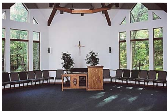
Cleveland Chapel before renovations.

A special Thank You goes out to all the donors who made this renovation possible. -The Pilgrim Park Staff