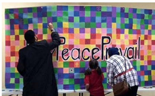
Peace Mural Project displayed at its first public showing on Feb. 19, at the We Are All America - Solidarity event at The Mecca Center in Willowbrook, Ill.

The Peace Mural is currently available for display at area events and locations. If you're interested in arranging a display, please contact the Peace Mural Project at info@peacemuralproject.com or contact St. Paul's United Church of Christ at stpaulsucc@stpaulsuccdg.org .