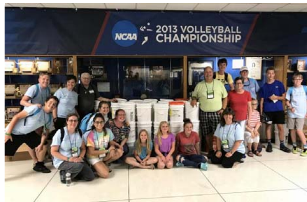
Onsite Bucket Brigade Team.