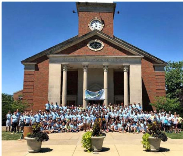
Youth gather at Elmhurst College for Great Lakes Regional Youth Event.