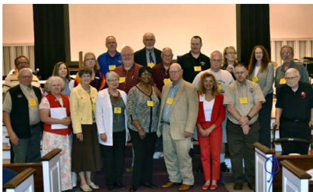
The new Conference Council.

The new Conference Council was installed at the Annual Celebration. The Conference website is in the process of being updated with the names of Council members, as well as members of all Conference Committees. Check the Conference website ( www.ilucc.org ) and look for the tab called "Ministries."