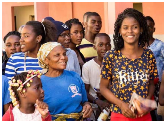
Palestina church welcome in Angola.