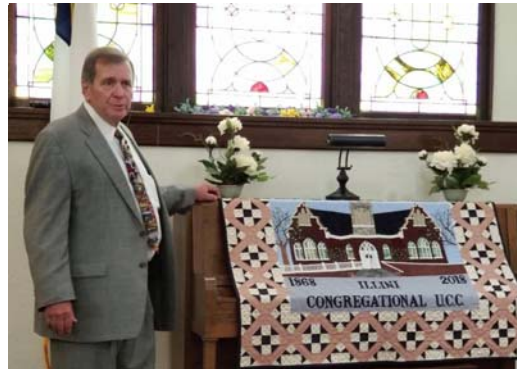
Illini Warrensburg Quilt honors the church's 150th anniversary.