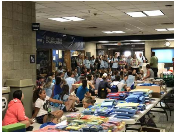
Great Lakes Regional Youth Event participants.